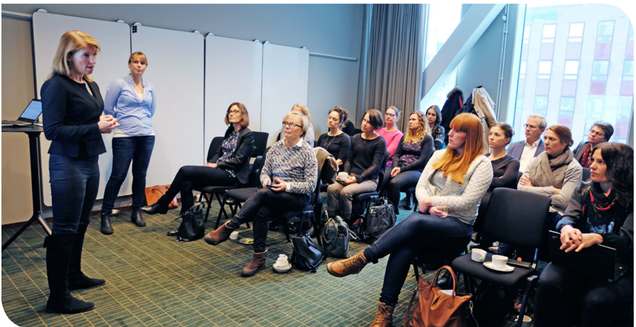
The Nordic Swan Sustainable Procurement Network holds many seminars to provide the opportunity for knowledge sharing on environmental and other sustainability issues.

The advertising campaign with the overriding message "Save the world a little every day" continued in Sweden, Norway and Finland. In Sweden there was an outdoor advertising in 34 cities at bus stops and underground stations, ads in major country-wide newspapers, followed by the digital campaign "The world's most important classroom" where celebrities gave a 3 minute speech in a classroom setting about what sustainability means to them. Ecolabelling Norway also ran an outdoor campaign in 40 cities and suburbs, digital ads at 55 shopping centres as well as ads in magazines and newspapers. In addition to this, the campaign provided