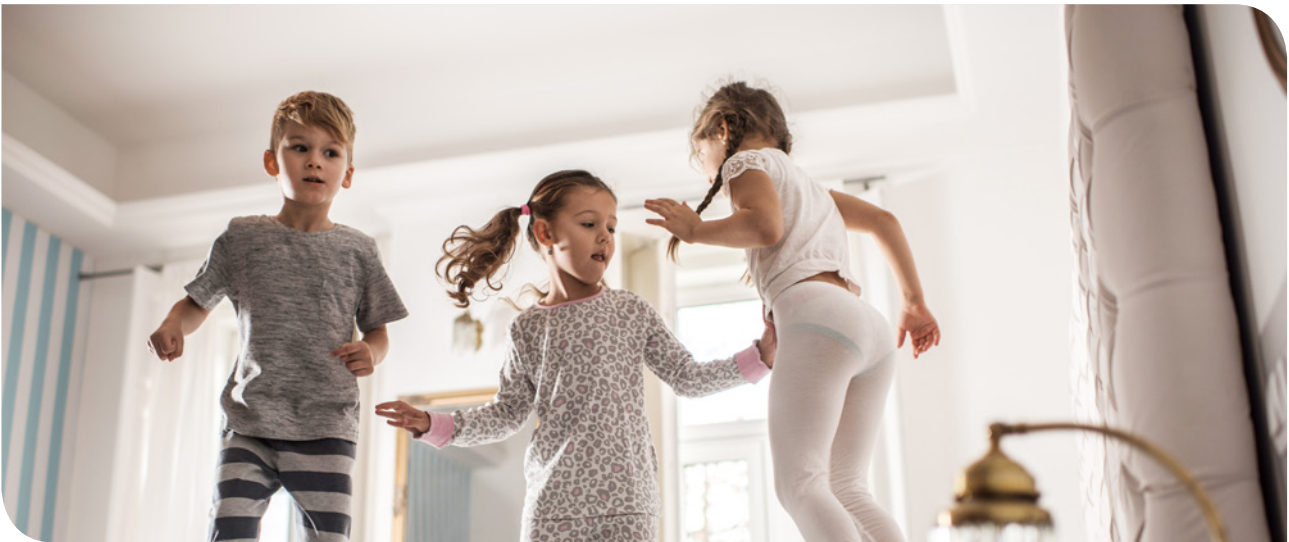
Nordic Ecolabelling's vision is a sustainable lifestyle.

and campaign work. In Denmark in recent years, Nordic Ecolabelling has worked to promote concrete quantitative environmental benefits within selected areas. This experience can serve as the basis for any ongoing work on quantifying environmental effects.