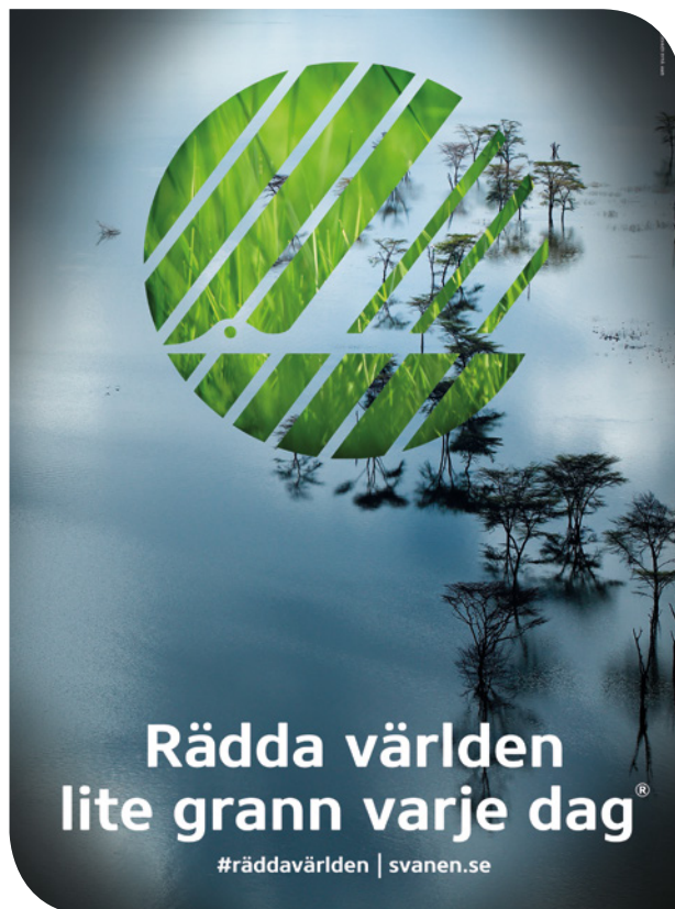
Swedish consumer campaign “Save the world a little bit every day”

become a strong symbol of consumer empowerment and environmentally friendly choices, were widely shown on national outdoor advertising, print ads in newspapers and magazines and online banners. Social media activation ensured high level of engagement from consumers. A majority of Danish supermarket chains participated in the two campaigns with offers on ecolabelled products and visibility in store, in trade papers and social media. Both campaigns were supported by extensive PR activation, which resulted in more than 160 press clippings from licensees, retail, stakeholders, authorities and national news media. Follow-up consumer research showed both a significant increase in unaided awareness of the Nordic Swan Ecolabel, and an increase in share of consumers looking for the Nordic Swan Ecolabel when purchasing. Awareness of the EU-Ecolabel grew from 38% (2015) to 44% (end of 2016).