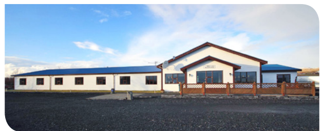
Hótel Fljótshlíð is a small hotel in rural Iceland.

We seem to have a new generation of tourists that put more emphasize on environmental issues and they demand to travel as green as possible. Today we are connected to foreign travel agencies that were specifically looking for hotels in Iceland that had an ecolabel so the licence really has paid off.