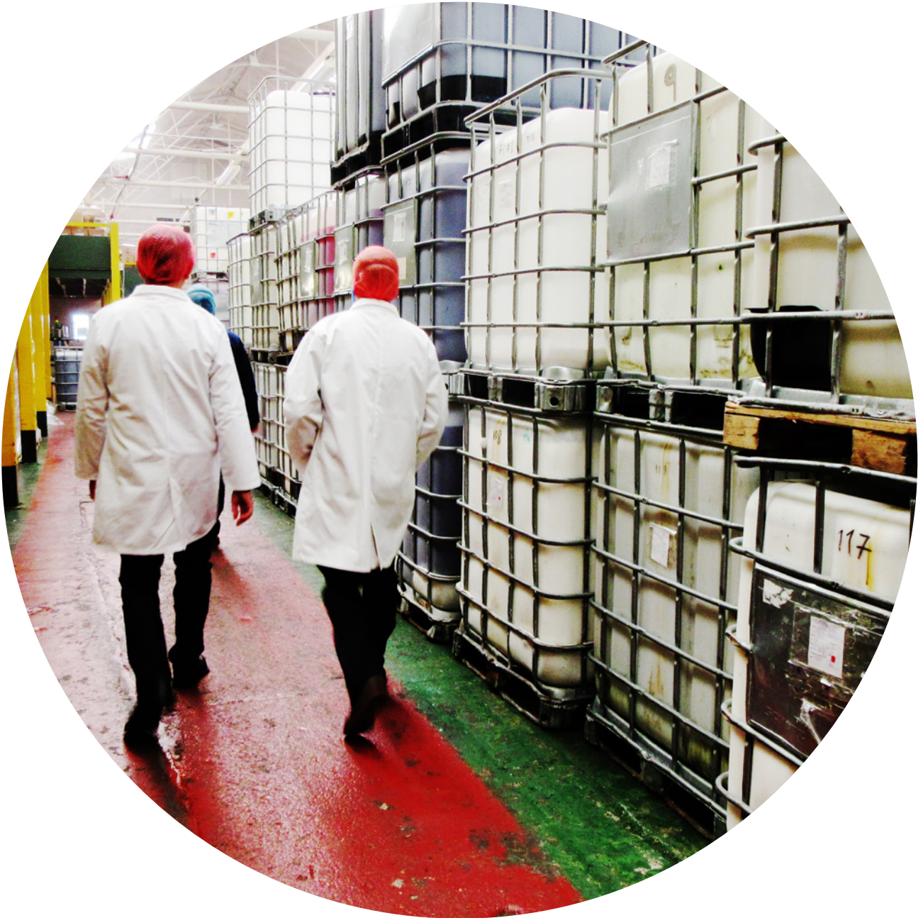
Nordic Ecolabelling regularly visits our licence holders for inspection.