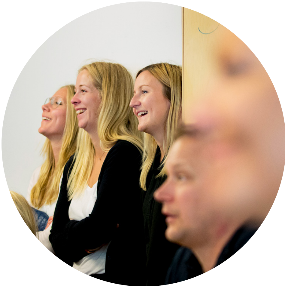
One of Nordic Ecolabelling Sweden's seminars during "Almedalen Week".

The Nordic Swan Ecolabel is now fifth out of more than 1,000 reputable brands in Finland, which is five places higher than in the preceding year. These were the findings of the Brand prestige 2016 survey by Taloustutkimus and Markkinointi & Mainonta magazine.