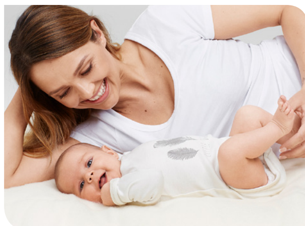
Cubus Nordic Swan Ecolabelled baby collection.

We sincerely hope so. Cubus has been making a great deal of green choices for a very long time, working with a substantial amount of Eco-Friendly cotton, BCI cotton etc. The Nordic Swan Ecolabel was an addition to and a way to highlight our sustainable effort, and we hope this will contribute to open the eyes of the customers on how we strive to do better for our planet.