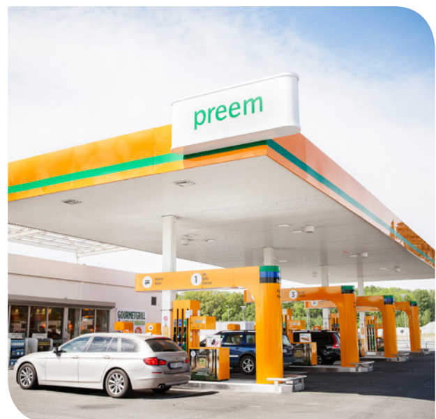
First Nordic Swan Ecolabelled liquid fuel in the world.

Absolutely, from both private consumers as well as our B2B customers. Most people want to choose what is best for the environment, and the Nordic Swan Ecolabel is instant proof of our product being the right choice. The Nordic Swan Ecolabel facilitates both for us and for our conscious customers.