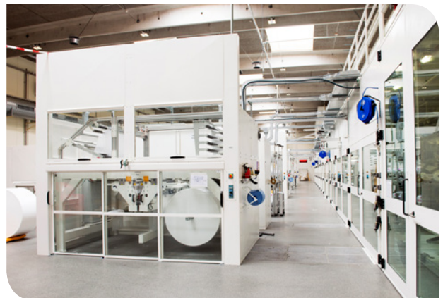
Abena's production plant.

There is also the task of making international customers understand what the Nordic Swan Ecolabel actually represents. We think that this is a story that needs telling and we would like to work alongside Nordic Ecolabelling to help improve this knowledge. Greater international focus is required. The label needs to be recognized outside the Nordic region and its value needs to be clear.