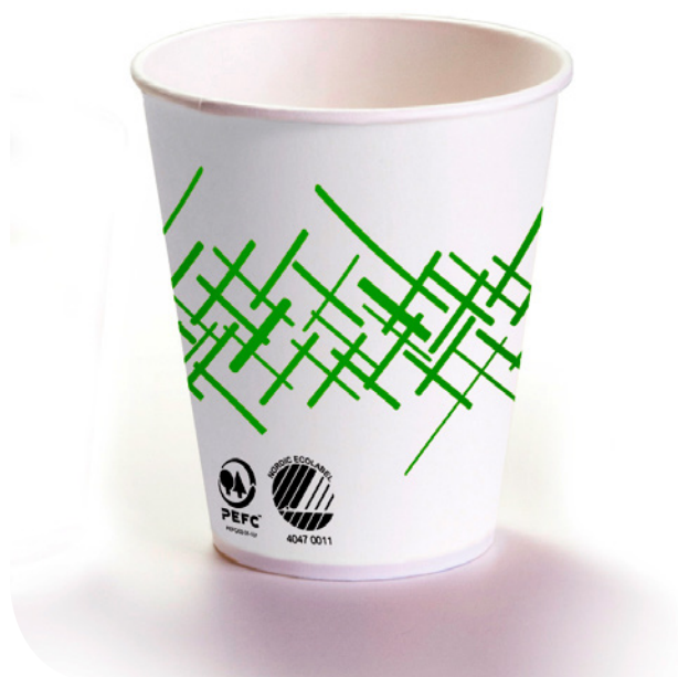
Huhtamäki's Nordic Swan Ecolabelled cup.

As the Nordic Swan Ecolabel is a well-known and trusted ecolabel, we believe it has a positive impact on end users. As a visual element on a product the Swan logo makes sustainable choice easier. This is one of the key benefits we offer to our customers.