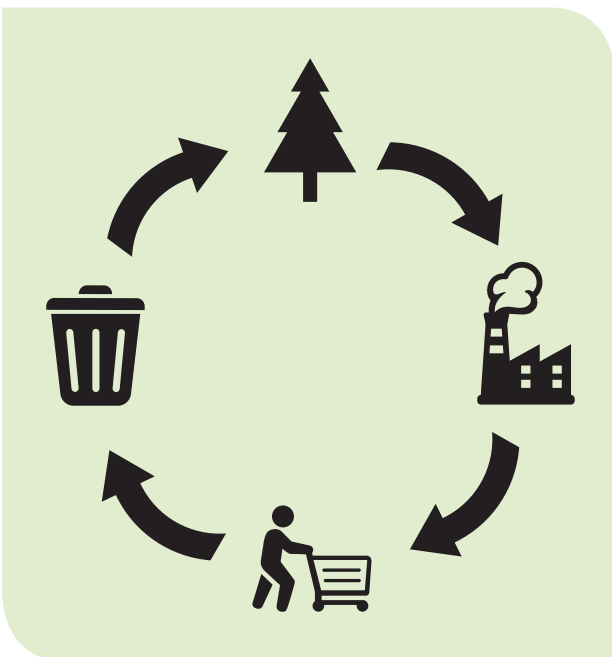
All Nordic Ecolabelling's criteria are rooted in a life cycle perspective.

New chemicals that are harmful to human health and the environment are constantly being discovered. At the same time, we still lack sufficient knowledge to be able to identify which particular characteristics of these chemicals and pollutants are having a harmful effect on our health and the environment. The effects are therefore difficult to assess. The majority of substances harmful to the environment being discovered today, are substances that break down slowly and are therefore found in the environment, foodstuffs and also in our bodies. Point sources of pollution, where chemicals are emitted in a more or less controlled manner, have been remedied over time. The most important source today