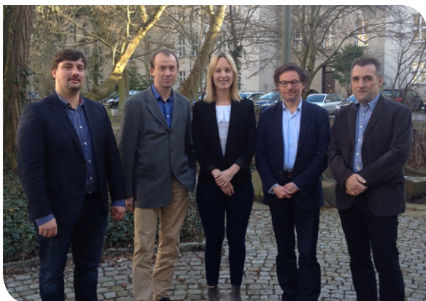
Nordic Ecolabelling in Berlin for a joint meeting with the Blue Angel.

In Denmark, the campaign “Your choice today makes a world of difference tomorrow” ran twice in February and October. The green shopping basket, which has